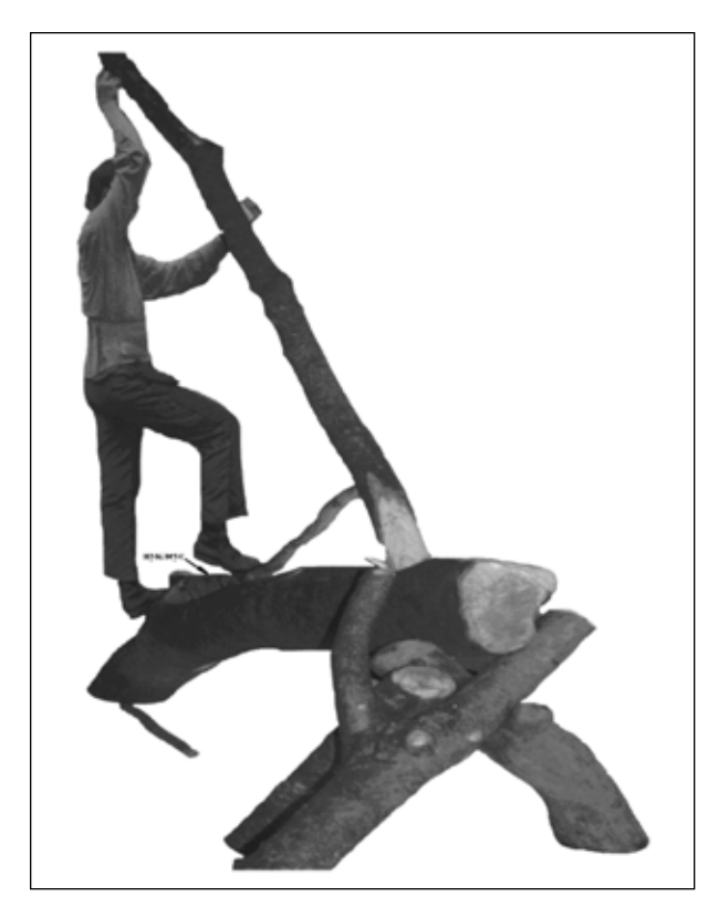
Figure 2. Method of flaking with the use of a lever, proposed by J. Pelegrin (after ARCHEA 2007: 13).

The process of their production was reproduced by J. Pelegrin and A. Morgado. In addition to flint objects, this part of the exposition included examples of pottery, bone articles, as well as votive objects.